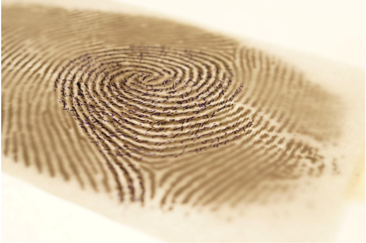
Manufactured Democracy (close up), Ink on paper 24x24 inches