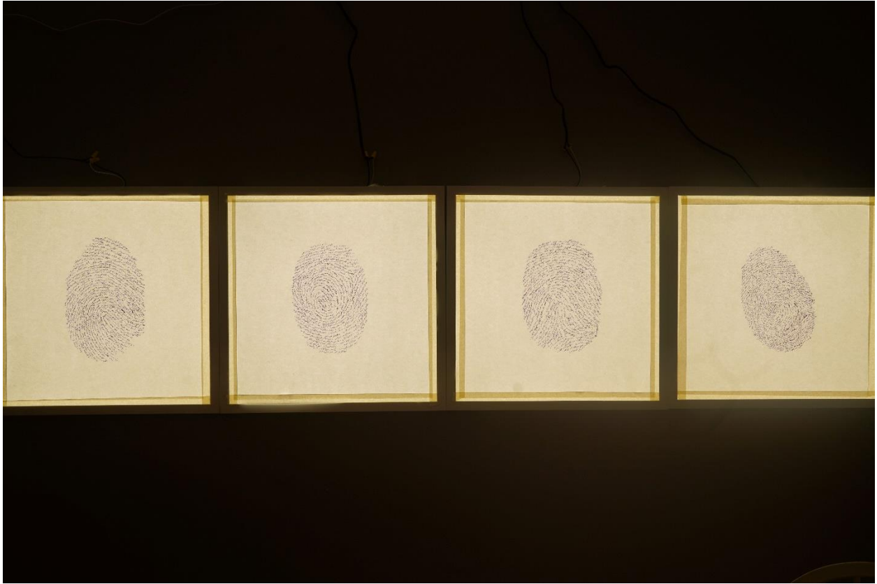
Manufactured Democracy, Ink on paper, 24 x 24 inches (each panel)